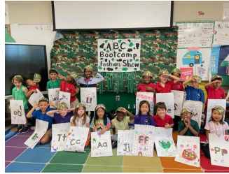
ABC Bootcamp Fashion Show