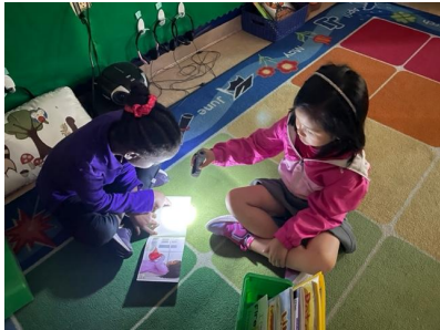
Flashlight Friday Buddy Reading