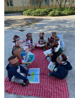
Teddy Bear Picnic