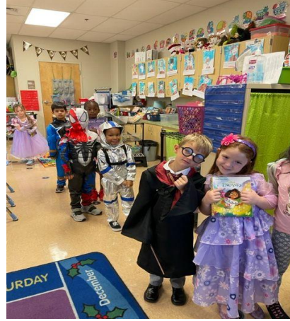
Book Character Parade